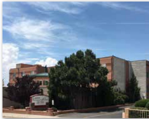
At Lomas and Juan Tabo

Call for a complimentary lunch and tour. 505.298.9976